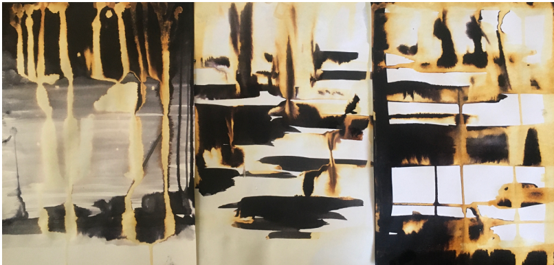
Figure 4: 'Untitled'. Participant 2 (Ink, water, bleach)