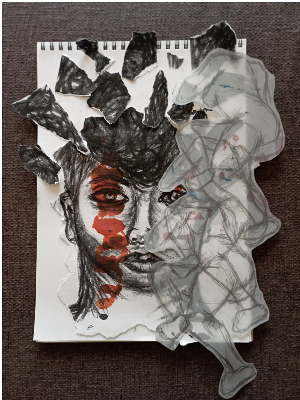
Figure 3: 'When I melt into you' . Participant 1 (Charcoal, ink, pencil, paper)

When asked whether they believed resilience to be something that one can practise, participants' answers varied. Participant 1 described resilience "as a muscle you have to keep adding" and Participant 2 believed it to be something which "comes and goes", adding "I would hope that it comes when resilience is required, but I don't, I wouldn't call myself a consistently resilient person". These beliefs suggest that an individual's capacity for resilience is not static across their lifespan, corresponding with the work of Herrman et al. (2011, p. 263) who advocate the same. Participant 1's reference to resilience as a practicable and repetitive pursuit seems echoed in their use of twisting figures along the right-hand side of the work. Their reference to integration could also be implied through a mixed media approach and the choice to tear up and then reform the upper part of the figure's head.