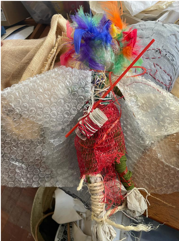
Figure 5: 'Preparing' . Participant 5 (Mixed media)

Interestingly, Participant 5 described her creation as a warrior doll and/or sangoma, alluding to the cultural implications of resilience and what it means to heal. The warrior doll holds a large staff and a small container filled with herbs collected from the participant's garden.