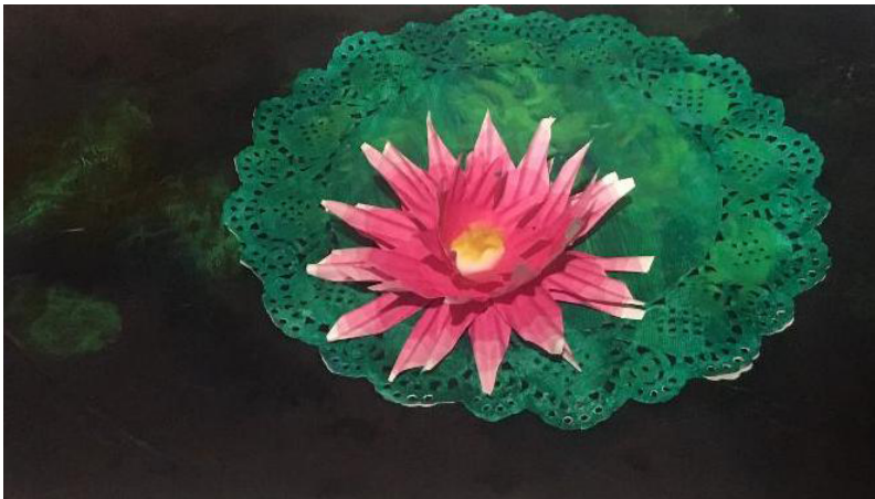
Figure 2: 'Celebration' . Participant 3 (Recycled materials, tissue paper and paint)