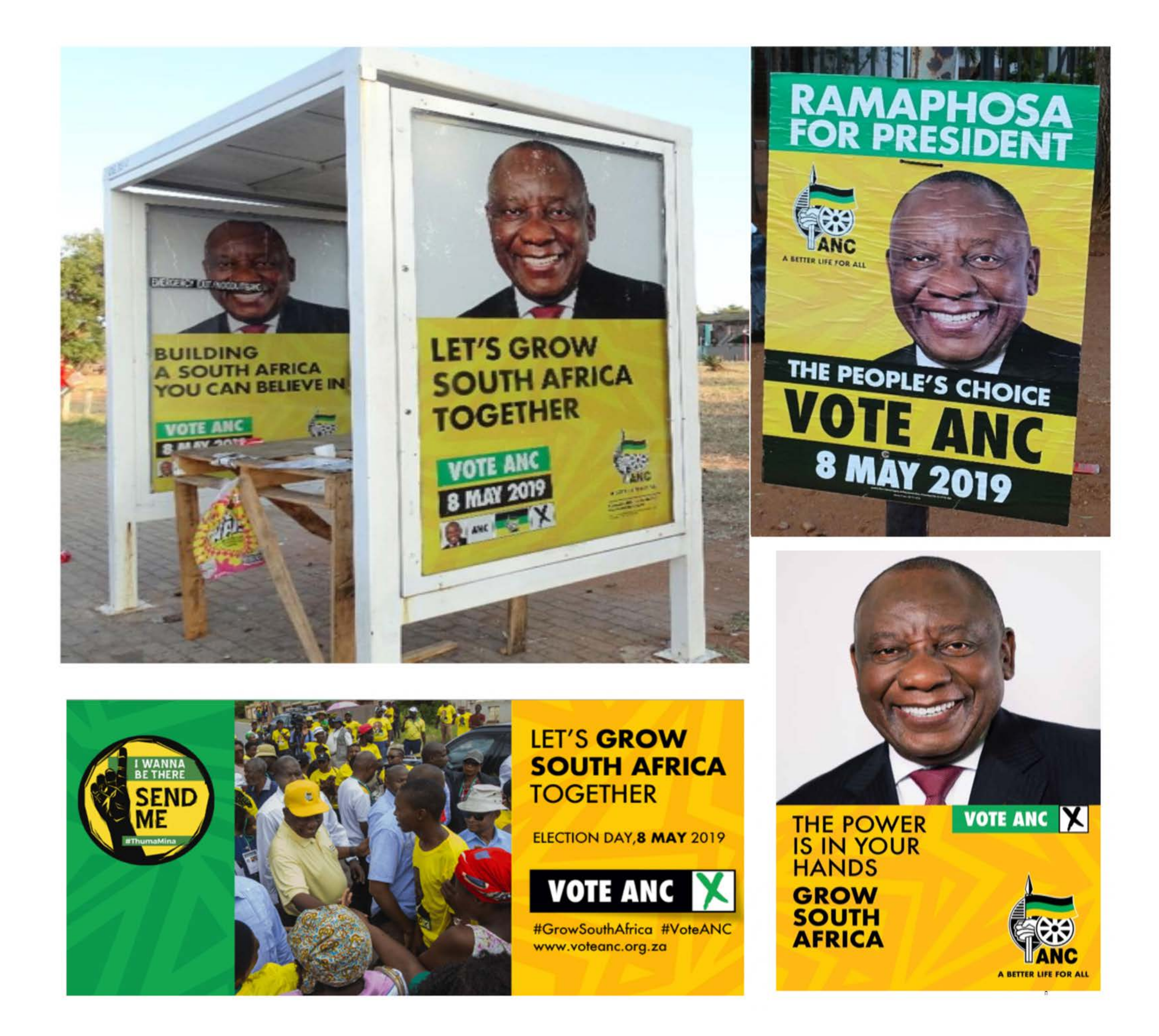
Figure 1: ANC 2019 campaign posters: Credit: ANC/ Authors