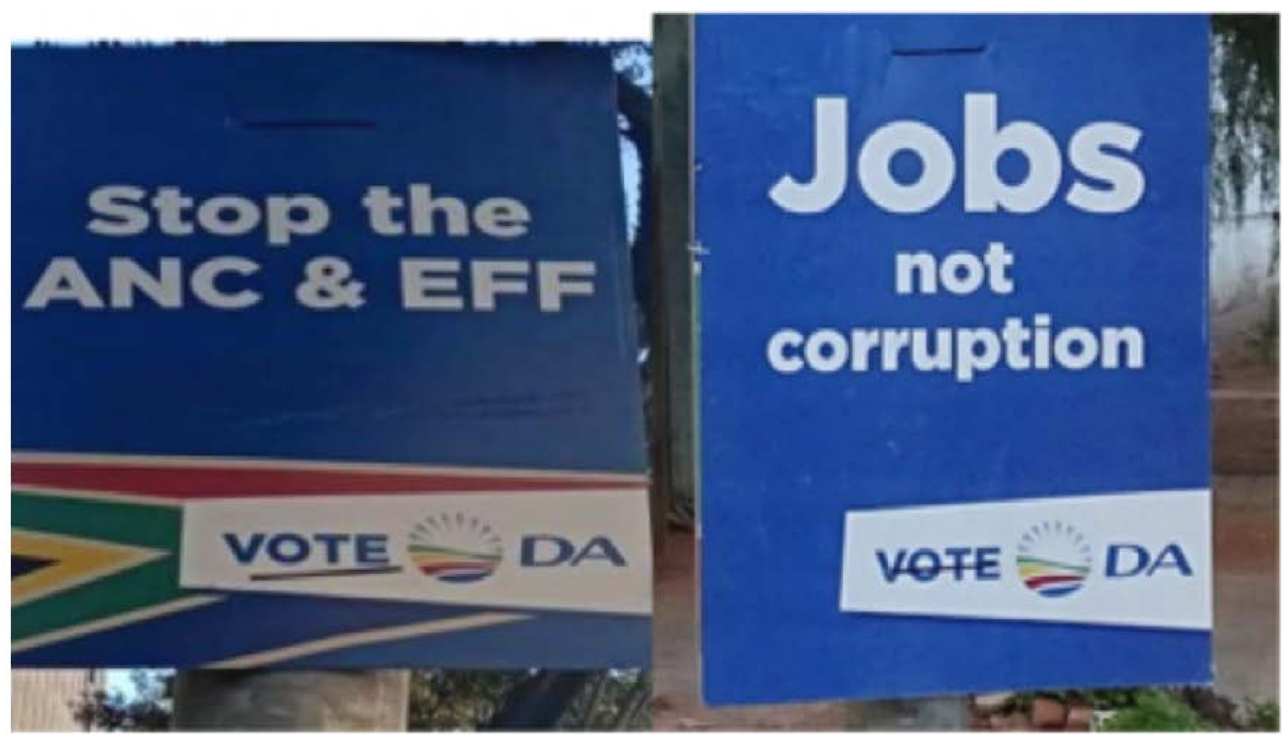
Figure 3: DA 2019 election campaign posters.