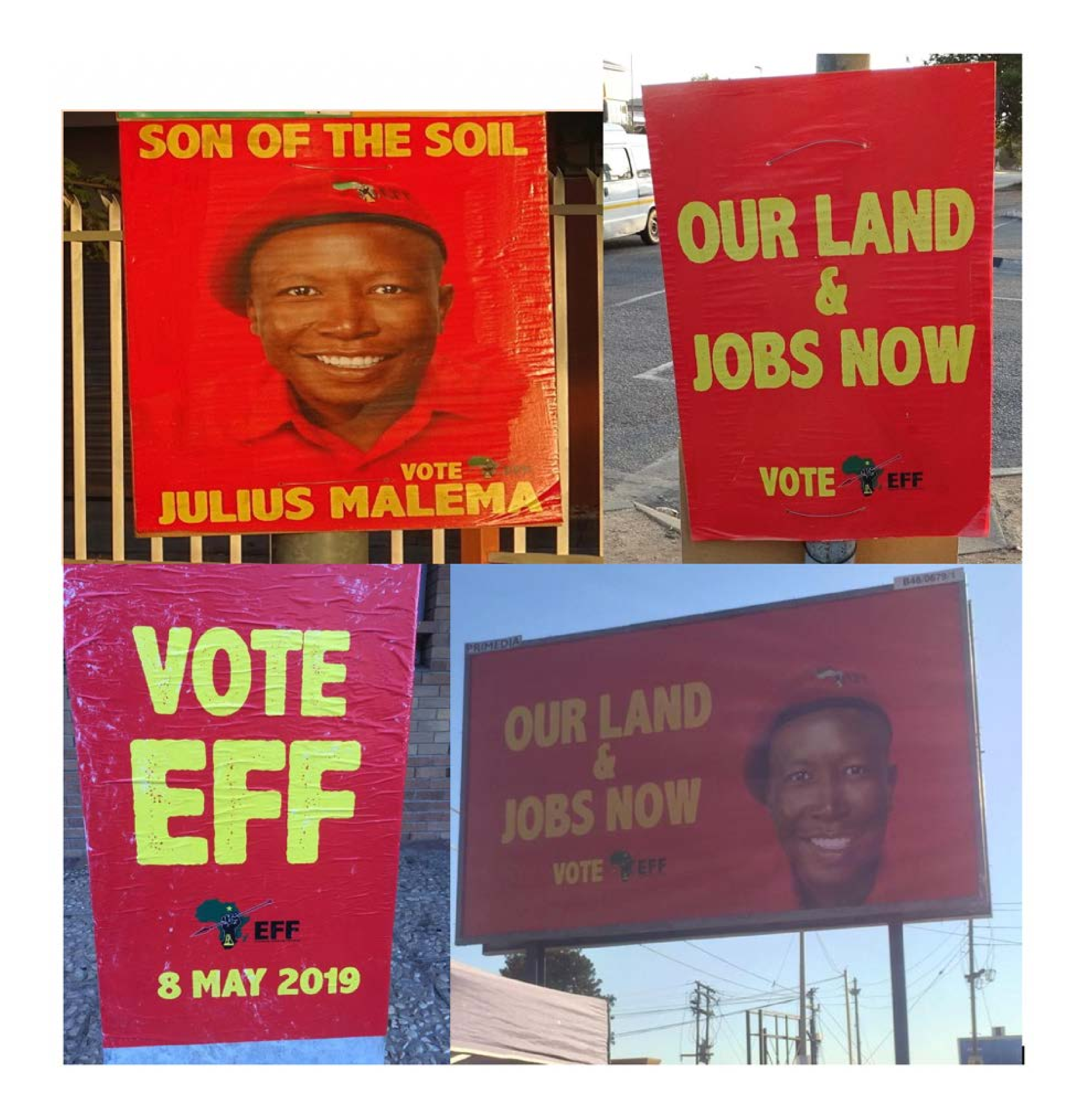
Figure 2: EFF 2019 Election posters.