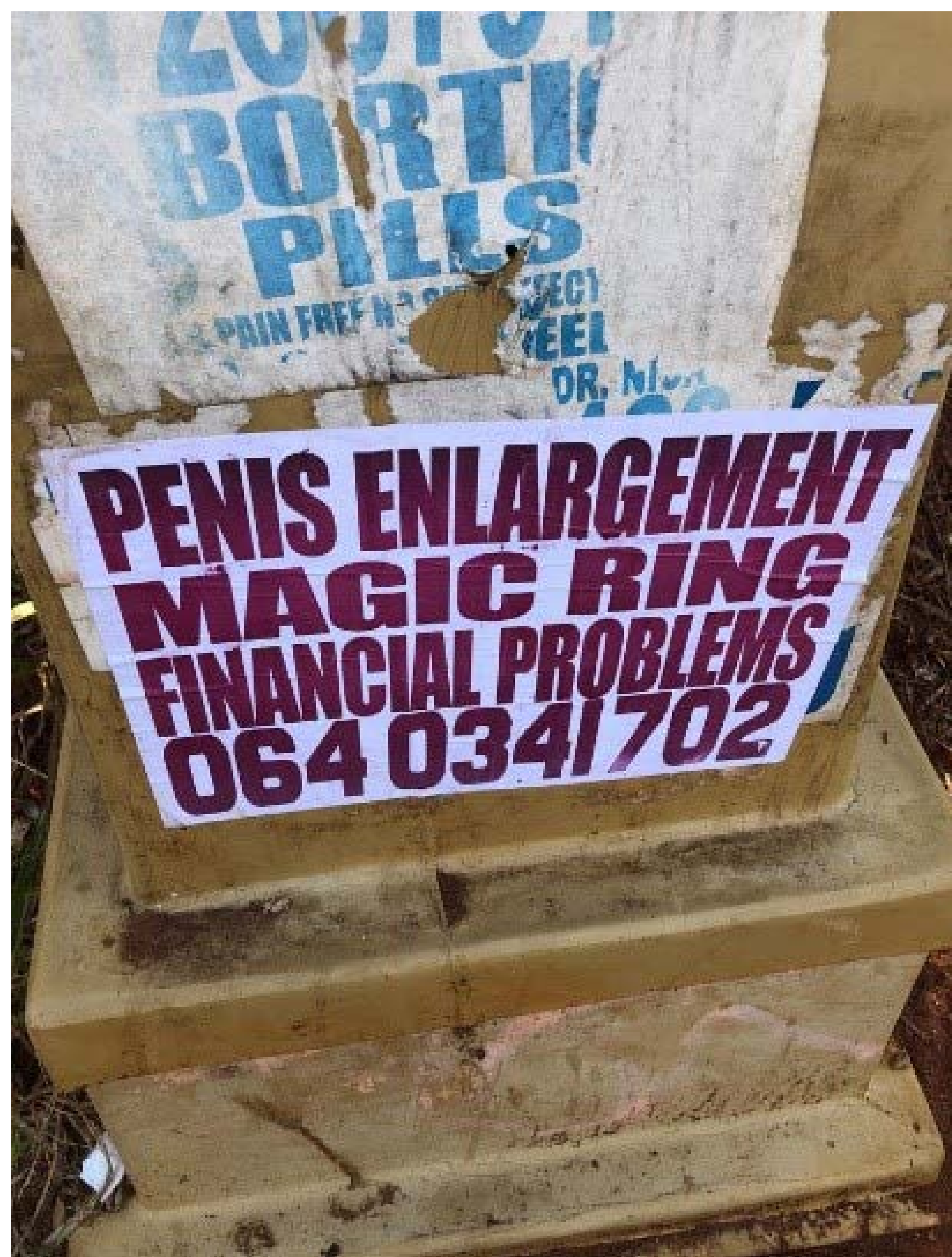
Figure 1: Poster on an electrical box in Johannesburg CBD shows a multi-layered history of poster adverts centred on the theme of sex enhancement and economic prosperity

Flyers and posters are affordable ways for people to market their businesses. In Johannesburg, informal herbal healers sometimes employ people to stand along various central business district (CBD) streets, distributing flyers which market their services. These agents generously hand out the flyers to passersby who are usually in a rush in the hustle and bustle of the city. Posters pasted on walls, street electric lamp posts and boxes are an alternative advertising channel. The competition for advertising space is evident in how these posters are usually pasted one on top of the other, sometimes resulting in layers of newer adverts on top of old ones (Figure 1). This scenario shows that there is great competition for customers, which again suggests that the business has a wide market pool.