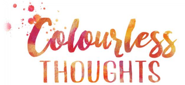
Figure 1: Colourless Thoughts Student Campaign - gender inequality visual concept, 2017.

For example, the Colourless Thoughts (figure 1) group members spent time talking to and actively engaging with retail employees, their peers and other females in their identified communities, to understand the products and attitude of the organisation towards gender inequality. The multinational organisations all the groups identified for their projects were grappling with serious workplace gender-inequality issues, which the students demonstrated in their research. Not only did they look at organisational sources for information, but they also uncovered information from the social media backlash that Bic had endured (for example, Davies 2015; Bic issues apology ... 2015) so that they could interrogate the manufacturer’s approach to gender inequality in the workplace. Colourless Thoughts as a campaign concept advocated that women do not want to be boxed in or labelled, and that they do not have to think like men for their thoughts to be valid. Their visuals reflected this insight in their presentation.