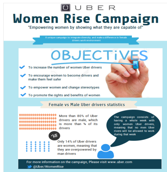
Figure 2b: Uber Women Rise Student Campaign - gender inequality infographic, 2017.