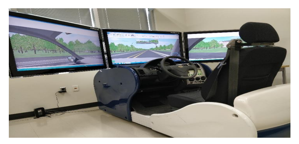
Figure 1. Driving Simulator

Driving data such as speed, acceleration, throttle, lane changing, brake, collision, and offset from the lane center were collected in a fixed high-fidelity driving simulator. The driving simulator directly logs all the related data. The driving simulator has three 40" screens, and the software (UCWinroad) has the capability of making realistic roads, signals, signs, models, and traffic (Figure 1).