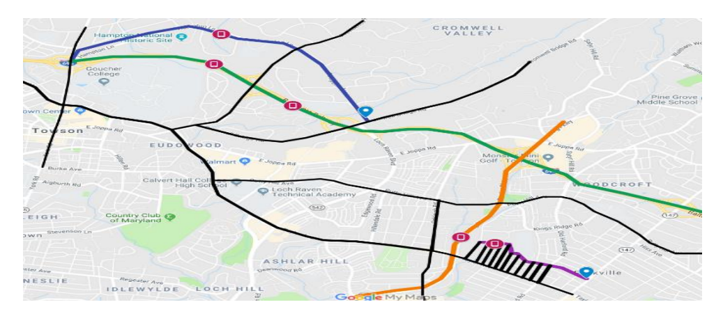
Figure 2. Study Area

A medium road network of Baltimore County, which consists of various road types (rural collector, freeway, urban arterial, and local road in a school zone), was considered as the study area (Figure 2).