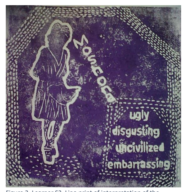
Figure 3. Learner S3. Lino print of interpretation of the stigmatisation suffered by the minority learners of a specific tribe. Lino block print on paper, 2014, 210 x 297.

Learner M1 made the mosaic piece in Figure 2 and described what the different colours stood for; this opened up a discussion on what languages people must speak and why. Language issues were tied to culture and heritage, and these were discussed in the process of producing artworks. In this way, learners addressed issues of language, race, citizenship and belonging as artists. Because learners cannot be sensitised to the existence of people who are not like them by merely being told to like others, silencing of these languages aids the denial of minority tribes within spaces of learning. Therefore, it was found that teachers should attempt to even the playing field so that the languages and cultures of individual learners are perceived as equally valued and powerful.