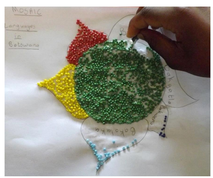
Figure 1. Learner N1. Mosaic of different languages and cultures within the school. Beadwork on paper, 2014, 148 x 210.