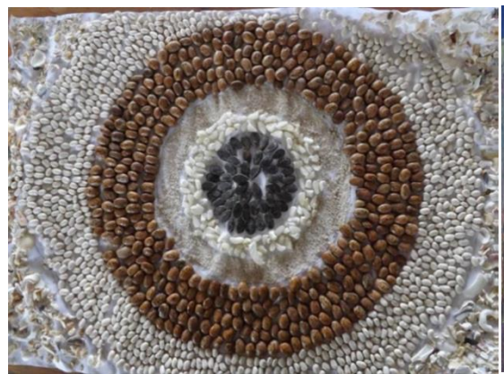
Figure 4: Learner T1. Mosaic of different food and cultures within the school. Varieties of beans and seeds on paper, 2014, 210 x 297.

The learners discussed a variety of issues while they were brainstorming on ideas for their art project (figures 4 and 5), including issues of difference and discrimination. They identified similarities such as food types, which they used to produce their mosaic. By linking art-making to learner experiences that are personal and meaningful, learning became a process that was active, purposeful and critical. As Learner S2 noted when they were discussing a linoleum print on paper (Figure 3), art can develop understandings by depicting experiences that are common to all, by reflecting things that make each cultural group special.