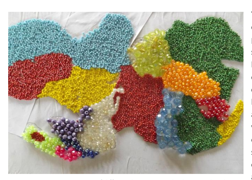
Figure 2. Learner M1. Mosaic of different languages and cultures within the school. Beads on paper, 2014, 210 \times 297.

The conversations that were held during the art-making process projected the learners' inner understanding of the outside world onto the social world. The mosaics and collages (Figures 1, 2, 4, 5 and 6) became a way of disrupting and opening up spaces for discussing issues that affect learners in school. As the visual artworks were created by selecting and rearranging images or beads on a new surface, this process became a way to provide a safe space and structured resource for those who could not draw, paint or speak out on issues.