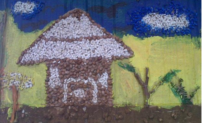
Figure 5: Learner F3. Mosaic of different food and cultures within the school. Samp and beans on paper, 2014, 210 x 297.

Some learners noted that other learners felt left out because of their racial status. Belief that differences between skin colours are ethnically driven implies that such beliefs are essentially fixed. These essentialist beliefs lead to categorisation of people (learners, in this case) into groups based on assumptions that surface characteristics reflect deeper essential features. Racial categorisation