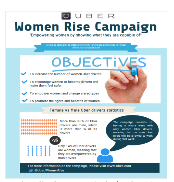
Figure 2b: Uber Women Rise Student Campaign - gender inequality infographic, 2017.