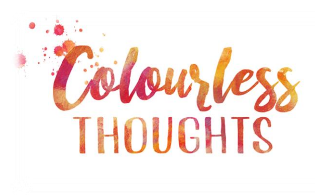
Figure 1: Colourless Thoughts Student Campaign - gender inequality visual concept, 2017.

For example, the Colourless Thoughts (figure 1) group members spent time talking to and actively engaging with retail employees, their peers and other females in their identified communities, to understand the products and attitude of the organisation towards gender inequality. The multinational organisations all the groups identified for their projects were grappling with serious workplace genderinequality issues, which the students demonstrated in their research. Not only did they look at organisational sources for