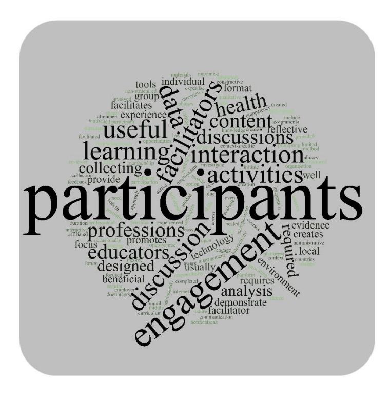
Figure 2. Word Cloud representing qualitative recommendations from experts